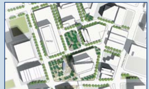
Midtown Proposed Site Plan