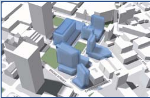
Midtown Proposed Site Plan

The Midtown Rising project partners—the State of New York, the City of Rochester and PAETEC Holdings, Inc.—recently unveiled the development plans for the nearly nine-acre Midtown site in the core of downtown Rochester, NY.