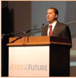
Governor David Paterson addresses audience of more than 1300 at the 2008 Eyes on the Future Economic Summit

In his remarks concerning the election, Governor David Paterson highlighted that "This was a hard-fought contest that has given millions of Americans a renewed sense of civic